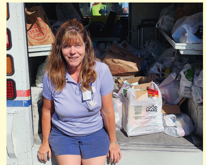
Pictured here are just a few of the hundreds of Letter Carriers from across the Branch who participated in this year's Food Drive.